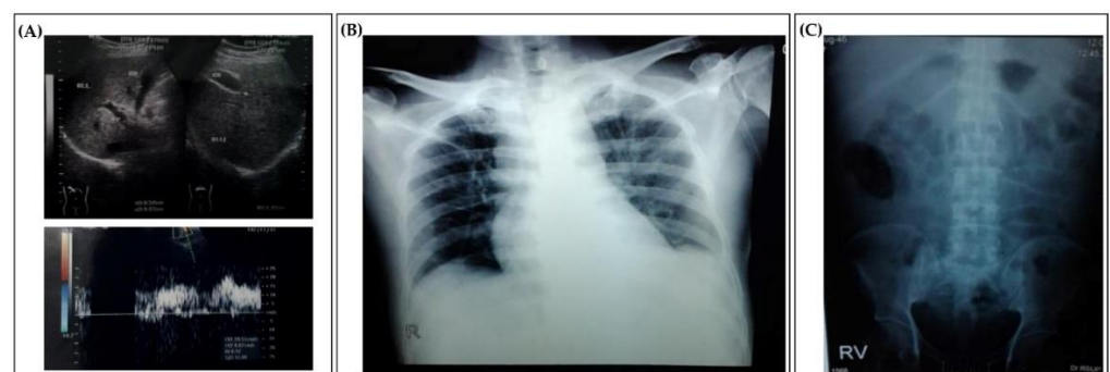
Figure 1. Radiological findings of our patients. (A). The abdominal ultrasound confirmed the presence of cholecystitis and cholelithiasis in the neck of the gallbladder. (B). The chest X-ray

A 50-year-old male presented at the emergency department of Bangil Hospital with a chief complaint of melena. He reported experiencing dark stools persisting for three days following cholecystectomy, accompanied by progressive abdominal distension and firmness. The patient had been experiencing abdominal discomfort for approximately two months, characterized by intermittent squeezing or stabbing sensations that occurred nearly daily, sometimes impeding his routine activities. While analgesic medication provided temporary relief, the symptoms recurred, and the patient noted increasing abdominal rigidity. Furthermore, since the onset of symptoms, he reported diminished appetite and afternoon fevers. Notably, the patient denied any respiratory symptoms. In terms of social history, he is married, works as an entrepreneur, and smokes two packs of cigarettes daily. He has a history of unprotected sexual intercourse and alcohol consumption but no history of tattoos.